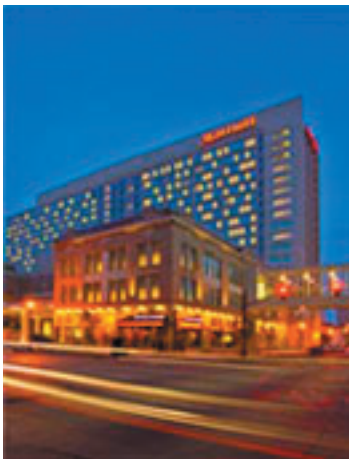
Marriott Louisville Downtown Hotel