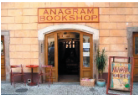
The Anagram Bookshop

With all of its bookstores, Prague solicits anabolic steroid-like nourishment for the intellectual mind. The most prolific English bookstores in Prague are