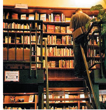
Inside the Globe Café

the Anagram Bookshop in Old Town and the Globe Coffeehouse behind the national theatre. The Anagram is a nondescript shop that neighbors a cozy café in one of the city's primary tourist districts. A short walk from the legendary astronomical clock in the city's Old Town Square, Anagram offers an impressive selection of intellectually rich if non-