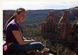
Taking a break during a hike at Colorado National Monument