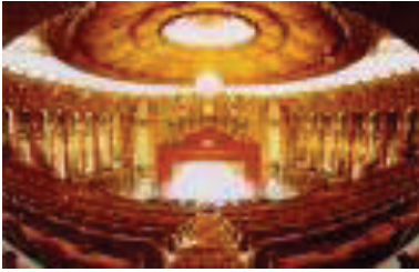
Fox Theatre St. Louis, Missouri

Rent bicycles or a quad cycle for a leisurely ride along the Bike St. Louis trails or the newly restored Riverfront Trail. The quad cycle is a four-wheeled bicycle with two bench seats that can seat up to 6 people. Helmets and trail maps are included with each rental. Look for the bike rental office on the Riverfront directly below the Grand Staircase of the Gateway Arch. The bicycles start at $15 per hour. The small quad cycle is $20 per hour and the large quad cycle is $25 per hour. The hours are Fridays through Sundays from 10:00 a.m. to 7:00 p.m.