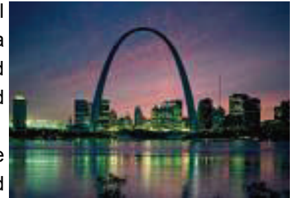
the Gateway Arch St. Louis, Missouri

Get a bird's-eye view of beautiful St. Louis on the St. Louis Skyline tour or, for the more adventuresome, take the longer Explore St. Louis tour on a helicopter. Tours star at $35 and run from 10:00 a.m. until sunset. The helicopter office is located directly below the Gateway Arch. There is a minimum of 2 passengers and a maximum of 3 passengers. Keep your ticket from the helicopter tour and save $5 on a bike rental.