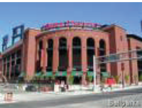
Busch Stadium St. Louis, Missouri

The Gateway Arch is America's tallest national park monument, standing at 630 feet above downtown and the Mississippi River. Each year, approximately one million visitors ride trams to the top of the Arch. The trams have been in operation for over 30 years, traveling a total of 250,000 miles and carrying over 25 million passengers. The Gateway Arch is .47 miles away from our hotel. The tour is $10.00 a person and takes at least one hour. The hours are 9:20 a.m. to 5:10 p.m.