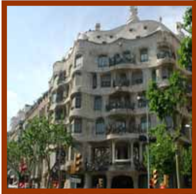
Casa Gaudi - Spain