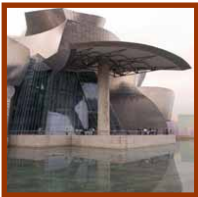
Guggenheim - Bilbao, Spain

I can no other answer make, but, thanks, and thanks. ~ William Shakespeare